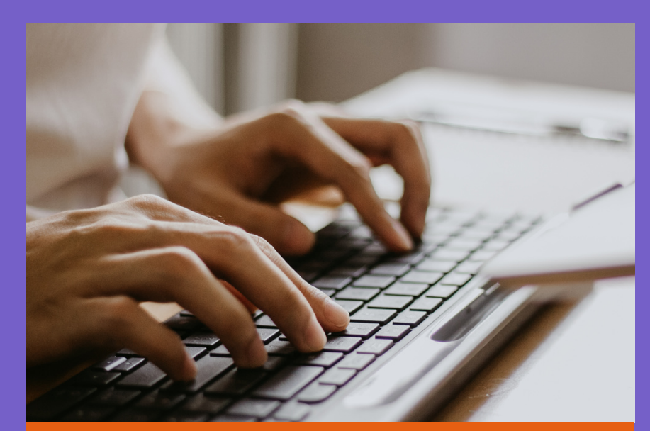
Tailored Cover Letter Examples 5 minute read